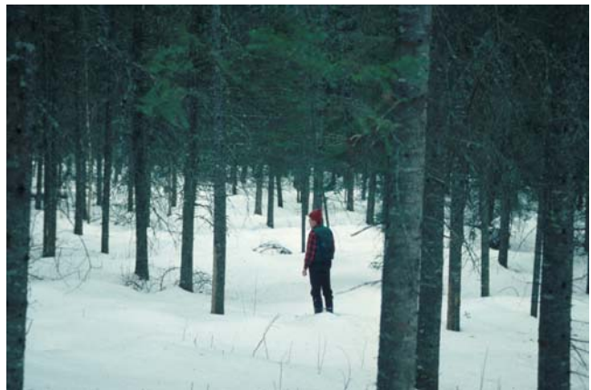
Spruce-fir shelterwood provides deer-wintering habitat in Victory Basin WMA.

Fish The section of the Moose River upstream of Rogers Brook provides the best habitat for brook trout.