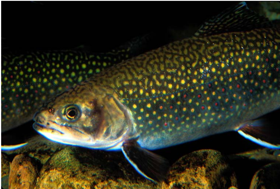
Native brook trout may be found in the Ottauquechee River.

Fish Wild brook, brown and rainbow trout occur in the Ottauquechee River at the edge of the WMA.