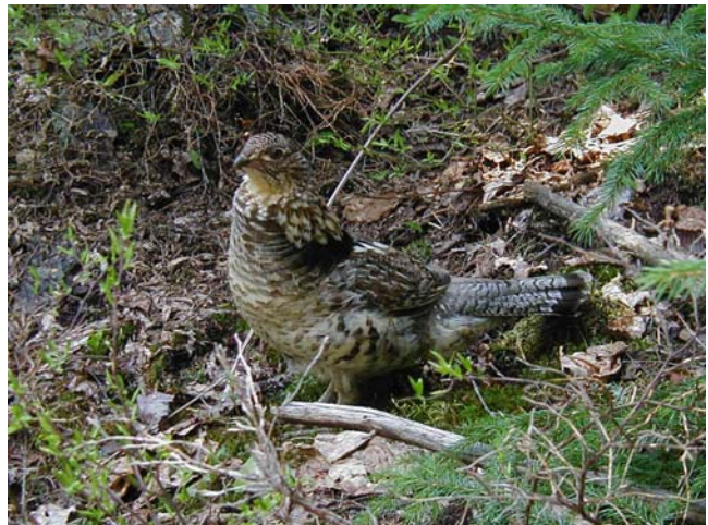
Ruffed grouse may be hunted in season at Les Newell WMA.

Fish There are wild brook and rainbow trout in the WMA's streams and beaver ponds.