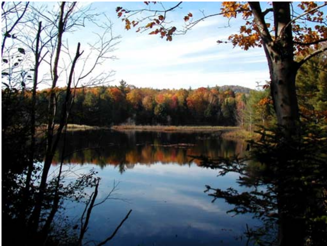
One of the man-made Knapp Ponds in the fall.

Knapp Brook Wildlife Management Area (WMA) is a 1,272-acre parcel of land located in the towns of Reading and Cavendish. It is owned by the State of Vermont and managed by the Vermont Fish & Wildlife Department. Included in this acreage is a 102-acre parcel on which the State only owns the hunting rights and an additional 231 acres on which the previous owners retained the timber rights. Knapp Brook WMA is part of the larger Cavendish Management Unit, which also includes Lord State Forest and Proctor-Piper State Forest. The WMA can be accessed by the parking lots provided at each of the dam sites or from the Moriglioni Road.