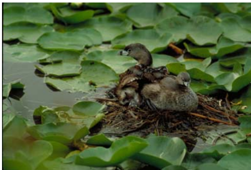
Pied-billed grebe with chicks. ©Jupiter Images 2004.

The Poultney River is one of Vermont's most biologically diverse rivers. It was designated an Outstanding Resource Water for its natural, cultural and scenic values, which gives it more protection. The lower reach of the Poultney River has the greatest diversity of mussels in the State, containing several rare and endangered mussels. The river is also rich in fish and other aquatic