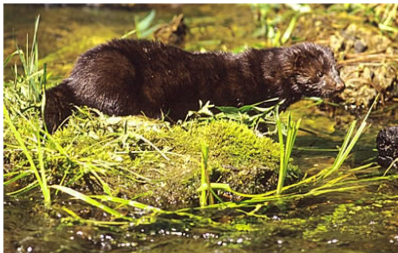
Mink forage in streams and wetlands.

Fish Star Lake is a shallow warmwater lake that contains several species of fish. The lake has been stocked as a put-and-take rainbow trout fishery since 1967. Yellow perch and largemouth bass have also been stocked in the lake. Largemouth bass were first stocked in 2001 after a winter kill, but there are no plans for future stocking. Other species found in the lake include golden shiners, bullhead catfish, pumpkinseed, rock bass and pickerel.