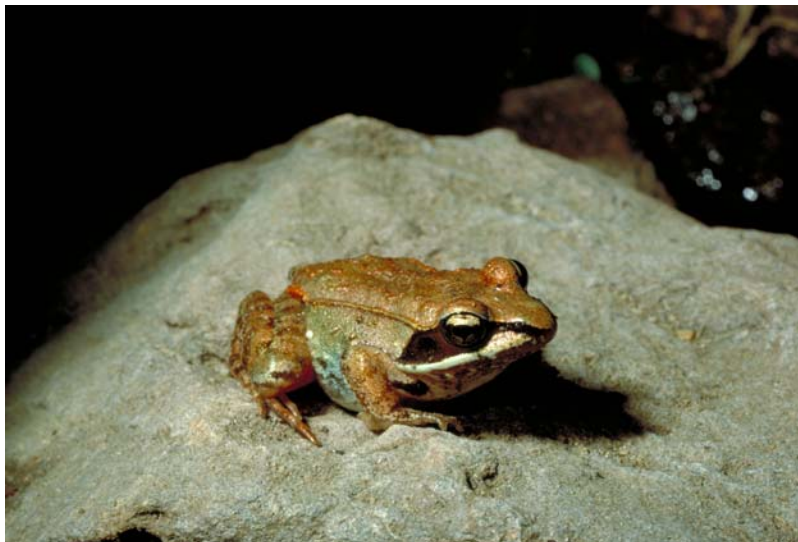
Wood frogs have a distinctive dark mask.

Fish South Stream contains a number of fish species including brown, brook and rainbow trout, with brown trout being the most common. Largemouth bass, brown bullhead, white and longnose sucker, creek chub, blacknose and longnose dace, rock bass, slimy scalpin, golden and common shiners, and pumpkinseeds can all be found in South Stream. South Stream Pond will share some of the same species as the stream but is unlikely to contain trout.