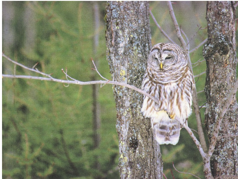
A barred owl on a perch.

Fish There are no fishable waters located on this WMA.