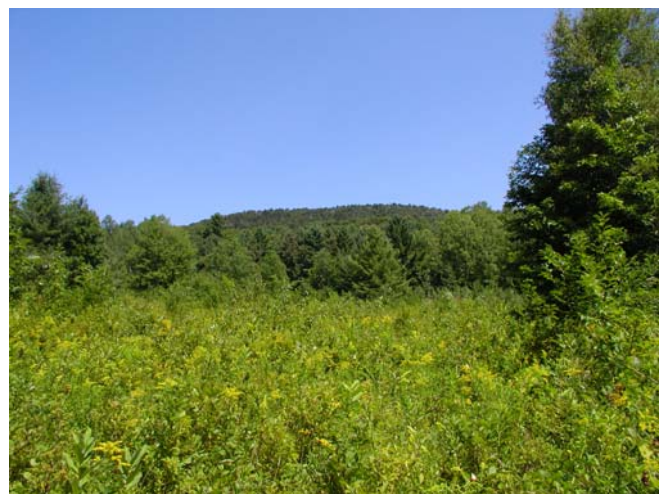
Looking upslope at Riley Bostwick WMA.

Fish Brook, rainbow and occasionally brown trout are found in Nasmith Brook. The brook also contains white suckers, creek chub, longnose and blacknose dace, and shiny sculpins.