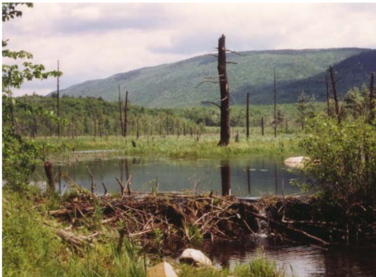
A view of the beaver pond at Kesick Swamp WMA.

Fish Brook trout and several other species of fish can be found in the two brooks and the beaver pond.