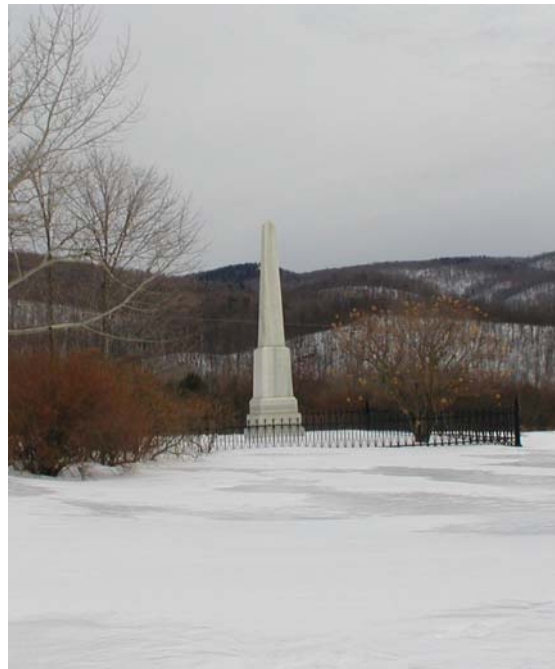
The Hubbardton Battle Monument is near the WMA.

Fish There is no water able to support a fish population on the property.