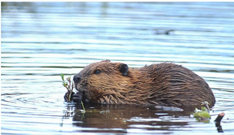
The industrious beaver creates habitat that is used by a number of other species.

Fish Brook trout and suckers have been reported in the marsh. However, fish numbers may be limited due to natural winter dieoffs that occasionally occur when a prolonged winter and snow cover deplete the pond of oxygen.