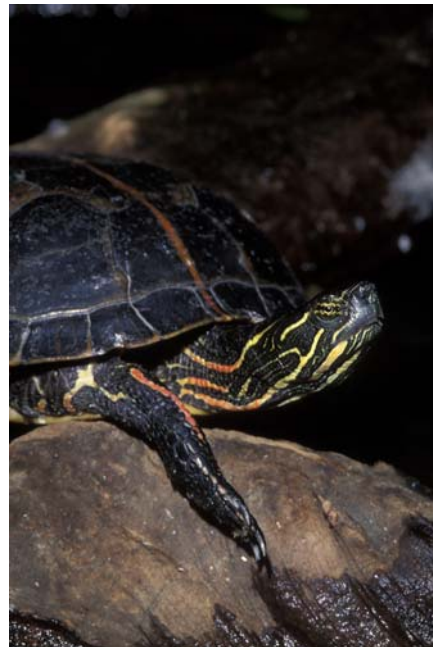
A painted turtle basking.

Fish Otter Creek supports a warmwater fishery of large and smallmouth bass, yellow perch, chain pickerel, northern pike and brown bullhead.