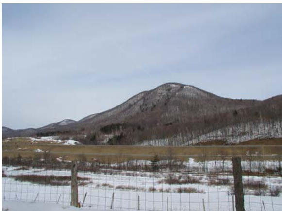
Looking at Blueberry Hill across Route 4.

and white oak, birches, maples, aspen, hickories, hophornbeam, and white pine. Old fields and apple orchards are scattered throughout the parcel.