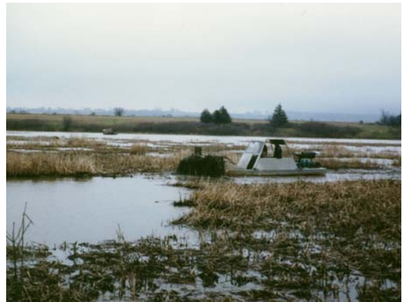
A "cookie cutter" creates openings in cattails to improve habitat for water birds.

Fish Fishing is allowed on the Controlled Hunting portion of the WMA through September 1 st . Yellow perch, bullhead and northern pike are some species that may be caught.