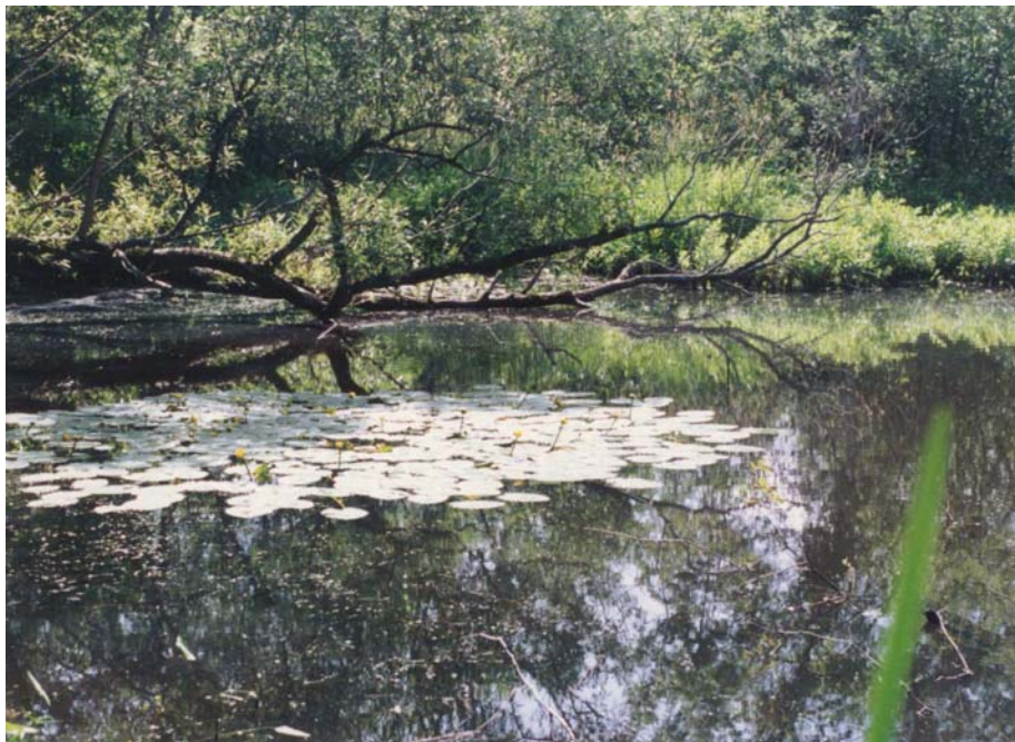
Water lilies float on the Lower Lamoille River oxbow.

Fish There is good fishing for northern pike, smallmouth bass and walleye in the Lamoille River nearby. The WMA itself has limited fishing.