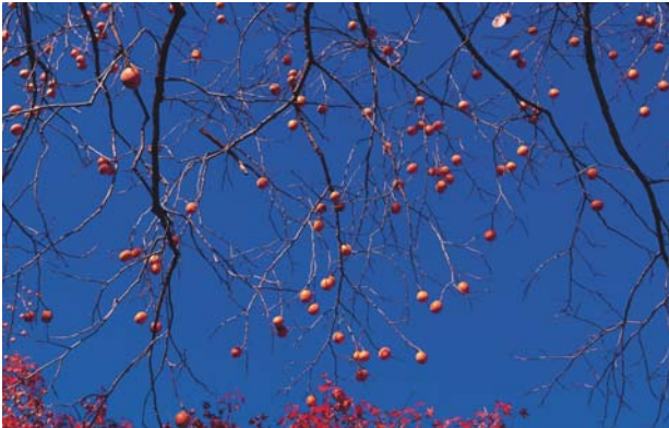
Apples are an important fall food source for wildlife.

The latest acquisition was in 2000. Federal funds generated from a tax on firearms and ammunition were used for that purchase. This purchase connects Lewis Creek WMA with Huntington Gap WMA, forming a large contiguous tract of public land.