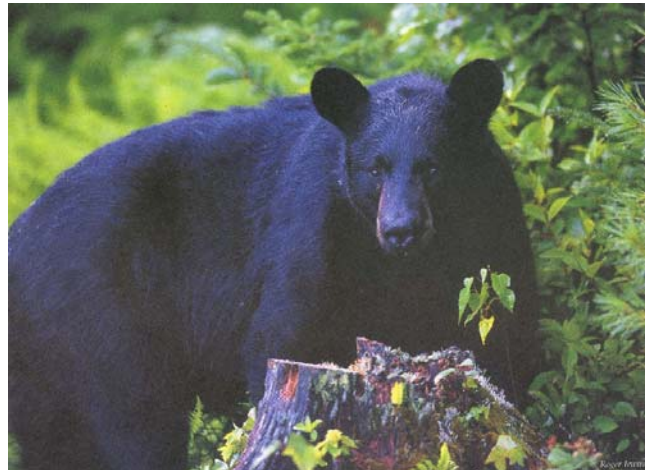
Bears must gain weight in the fall in order to survive winter hibernation. This bear is in prime condition.

Mammals Woodland and edge-dwelling mammals can be found on the WMA. White-tailed deer, black bear, moose, raccoon, coyote, beaver, mink, bobcat, fisher and snowshoe hare are species that may be hunted or trapped. Small mammals such as shrews, moles, voles, bats, chipmunks and red squirrels are also present.