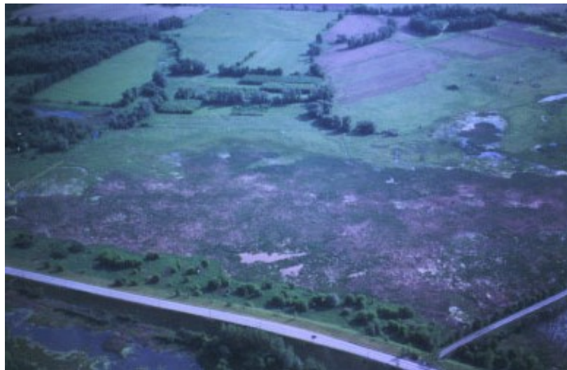
An aerial view of the Burlington Intervale showing the varied nature of a wetland complex.

Fish The Howe Farm unit borders the Winooski River. Warmwater fish that may be found in the Winooski River include large and smallmouth bass, perch, walleye and northern pike. Some of the old oxbows on the property may hold bass, perch and panfish.