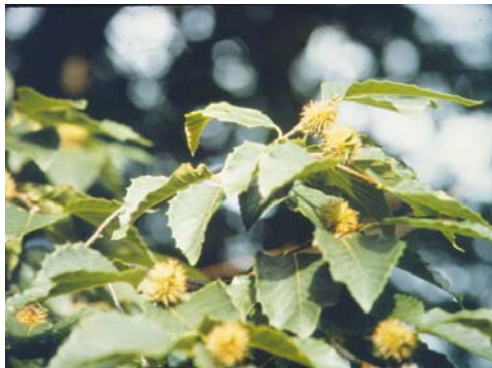
Beechnuts are a major food source for bear and other species.

The WMA is completely forested. Elevations vary from 1,800 to 2,800 feet. Baker's Brook flows through the southwest section of the property. The WMA supports a mix of northern hardwood forest and transitional yellow birch-red spruce forest. Red and sugar maple, yellow birch, beech, hemlock, red spruce, balsam fir and mountain paper birch are common tree species.