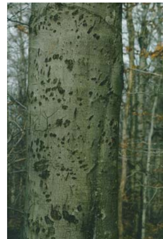
Bears climb beech trees to get to the beechnuts.

Mammals Huntington Gap WMA is part of a much larger forested tract; therefore, there is the opportunity for backcountry experience. There is hunting for large game – moose, white-tailed deer and black bear. There are good stands of beech that support a healthy bear population. Furbearers include coyote, fisher, bobcat, raccoon and mink. Snowshoe hare, masked shrew, deer and white-footed mice, woodland jumping mouse, chipmunk and red squirrel are some of the smaller mammals that can be found.