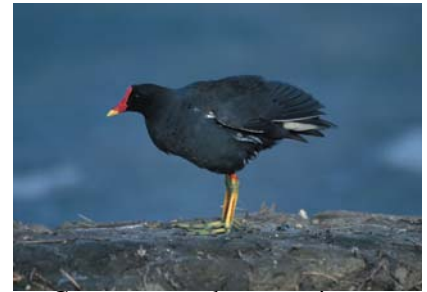
Common moorhens nest in some Vermont marshes.

bog. Bulrushes grow in large mats over standing water up to 6 feet deep. They provide feed and cover for water birds. The black spruce bog is home to the rare bog plants noted above. There is also extensive alder swamp in the WMA, which provides shelter and nesting habitat for a variety of songbirds.