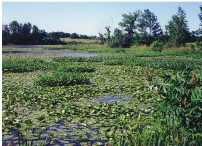
Wetland plants growing in East Creek provide habitat for invertebrates, which are a food source for birds.

Birds This rich wetland supports a large number of birds and a great variety of species. There is good birding for wetland species including rails, American and least bitterns, green and great blue herons, common moorhens, ospreys and northern harriers. Canada geese, black and wood ducks, mallards, blue and green-winged teal, and hooded mergansers inhabit the marsh. Marsh wrens, red-winged blackbirds, eastern kingbirds and Baltimore orioles are some of the many songbirds that can be found.