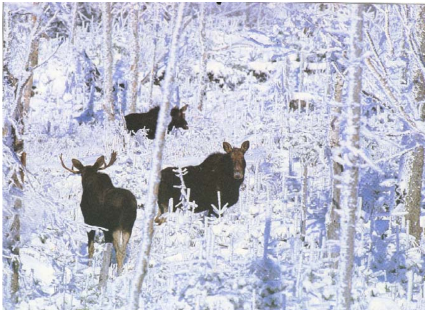
Good moose habitat contains shrubby growth and small balsams for browse.

Fish The South Branch River on the eastern side of the property contains brook trout.