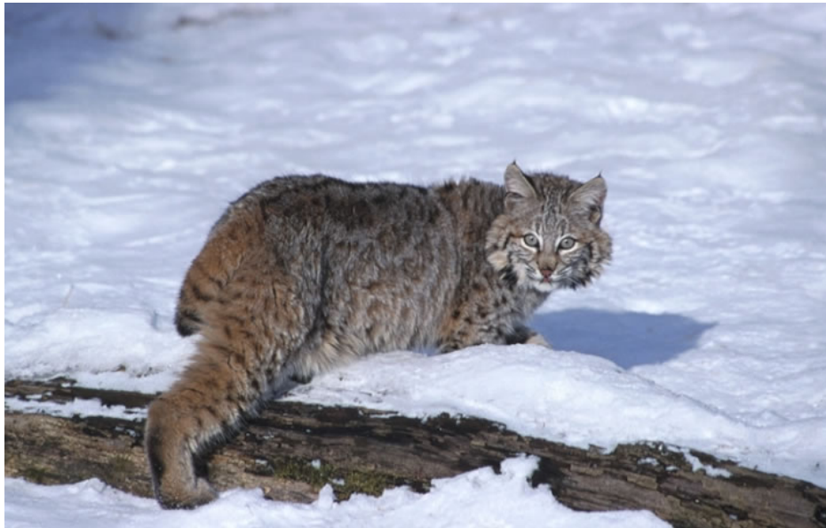
Bobcats are elusive inhabitants of Vermont's woodlands.

Fish There are no fishable waters on the WMA.