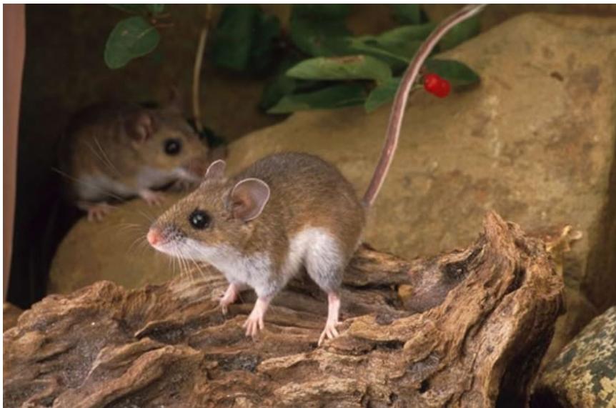
Small mammals such as deer mice are not as noticeable as big game, but are still an important component of Vermont's woodlands. They are part of the prey base for carnivores.

Fish There are no fishable waters on the WMA.