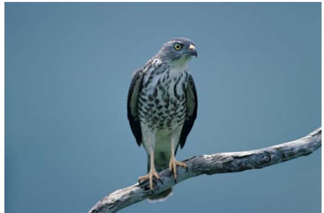
An immature goshawk on a perch.

Birds Ruffed grouse and wild turkey can be found on the WMA, as well as osprey, great-horned owl and goshawk. A variety of other deciduous and coniferous forest-associated songbirds are certain to be found.