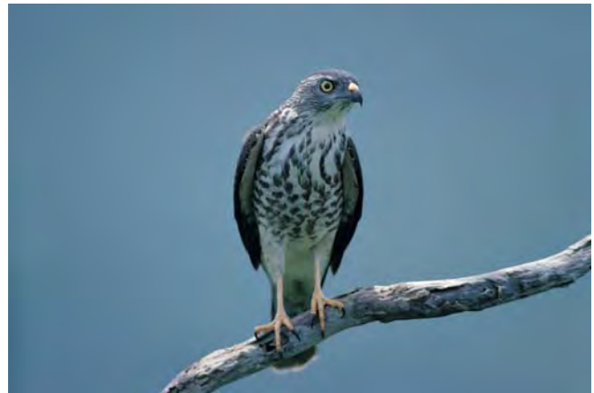
An immature goshawk on a perch.

Birds Ruffed grouse and wild turkey can be found on the WMA, as well as osprey, great-horned owl and goshawk. A variety of other deciduous and coniferous forest-associated songbirds are certain to be found.