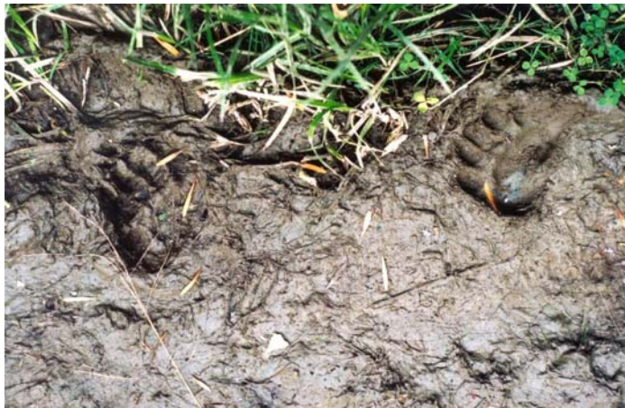
Bear tracks in mud and snow.

The WMA lies within the Winooski River watershed and is mostly forested with hemlock, white pine and balsam fir. There are two small intermittent streams present in the northwest and southeast extremities.