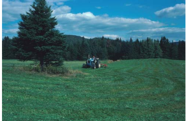
Agricultural lease at Steam Mill Brook WMA.

Many management practices are used to promote habitat diversity. These include mowing fields and openings, maintaining apple trees, regenerating and thinning timber stands, retaining mast stands and snags, and wetland buffer protection.