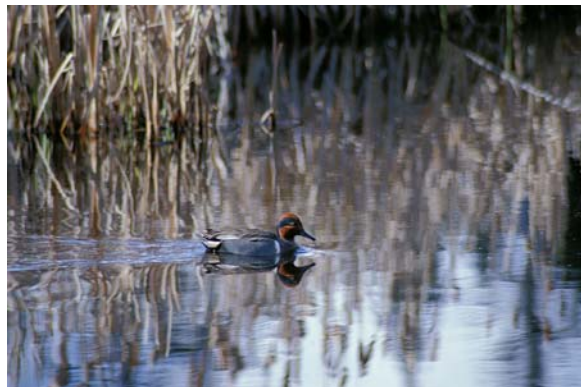
The shallow waters of Whitney and Hospital Creeks are attractive to migrating green-winged teal.

Fish Brown bullhead, yellow and white perch, black crappie, largemouth bass, longnose gar, northern pike, channel catfish and carp are all likely to be found in the waters of Whitney and Hospital Creeks and in Lake Champlain.