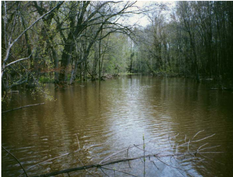
A quiet stretch of the Rock River.

Fish Northern pike, yellow perch, bullhead and crappie may be caught in Rock River. The sedge meadows along the river provide spawning grounds for these and other warmwater fish.