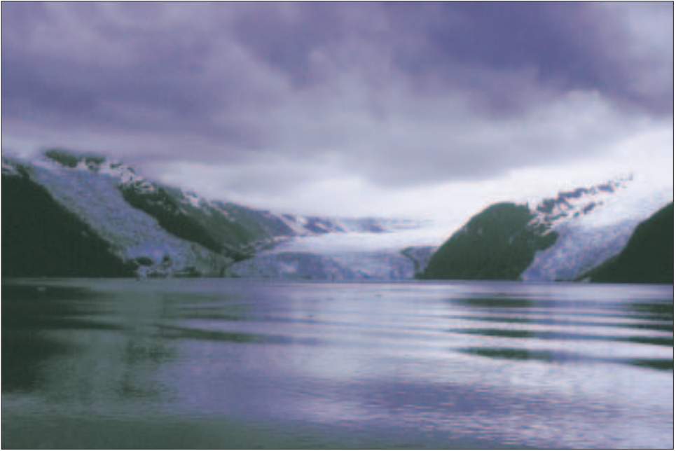
Glacier meeting water (College Fjord, Alaska).

sand and large areas of lake-deposited clay. For example, where the present-day Winooski River flowed into Lake Vermont (in the Champlain Valley), the slowing of the water caused the sandy sediments that were carried by the river to drop out. The result was a sand delta at the mouth of the river, just east of present day Essex Junction. The very finest sediments, the silts and clays, remained in suspension, later to settle out on the lake bottom. Most of the clay soils of Chittenden and Addison Counties were laid down during this time.