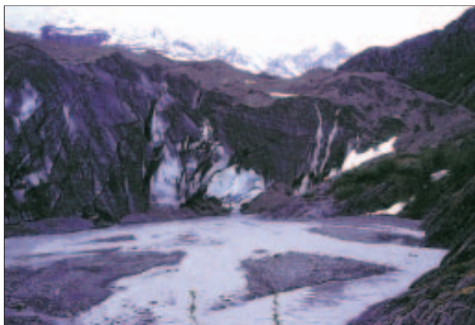
Flowing water transports sediment from the base of a glacier (Serpentine Glacier, Alaska).

When combined with bedrock geology, the surficial geology of the state and region can tell us a great deal about which communities can be expected where.