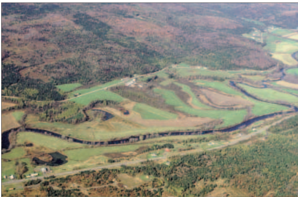
River valleys have been used by humans for millennia (Connecticut River; Canaan).

Vermont's vegetation has evolved and changed in response to all these events: the underlying bedrock laid down millions of years ago, surficial deposits left by glaciers and their meltwaters, changing climate, and human activity. Today's vegetation is a reflection of all these things working together and varying from place to place. The natural communities that occupy the modern Vermont landscape reflect the peculiar combinations of bedrock, soils, weather patterns, natural disturbance regimes, plant dispersal, animal movements, and history working together over a long period of time. Natural communities are always changing. Three hundred years from now, the climate will surely be different, the forests will have recovered from the abuses of the 19 th century, and humans will have had new impacts on the land that we cannot even begin to predict. Just as surely, the combinations of plants and animals that occupy a given place on the landscape will be different from those that occur there today.