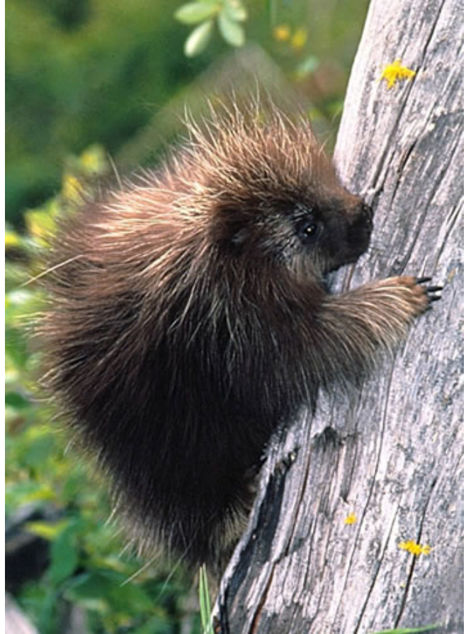
Porcupines inhabit northern hardwood forests.

Mammals White-tailed deer, moose and black bear inhabit this WMA. Porcupines may find suitable dens in the many rocky cliffs and crevices. Signs of the more elusive carnivores are commonly found, including those of coyotes, bobcats and fishers.