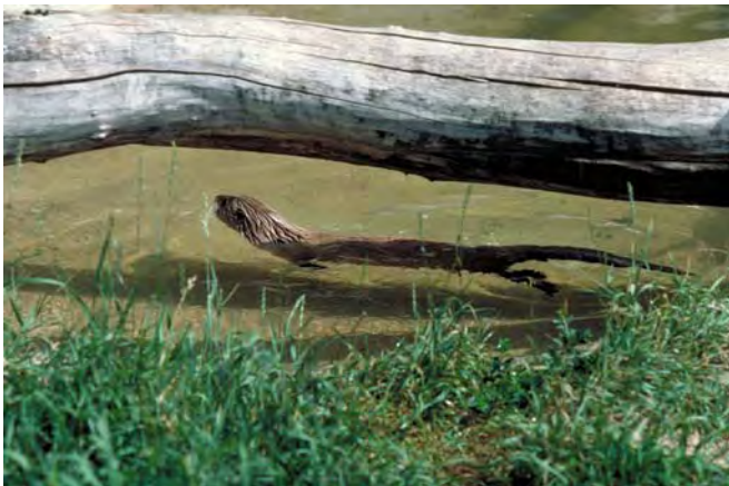
River otters benefit from beaver-created wetlands.

The topography of the Atherton Meadows WMA is quite variable. The elevation at Route 100 is 158 feet – the lowest on the parcel. An old beaver pond sits in the center of the parcel at an elevation of 1,840 feet.