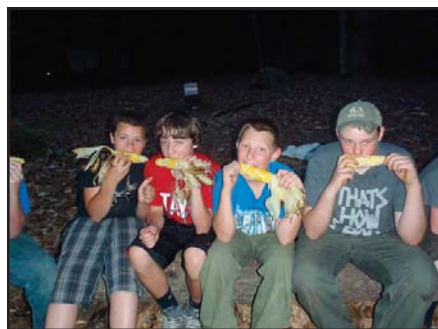
Campers at Kehoe enjoy campfire corn during the overnight campout.