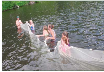
Buck Lake campers seine netting during the fisheries biologist activity.