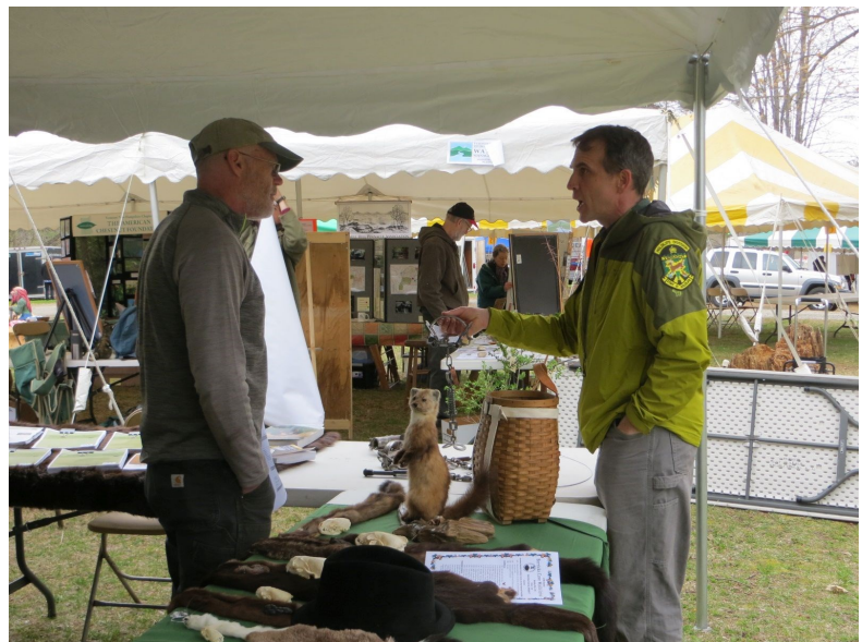
Herrick's Cove Wildlife Festival