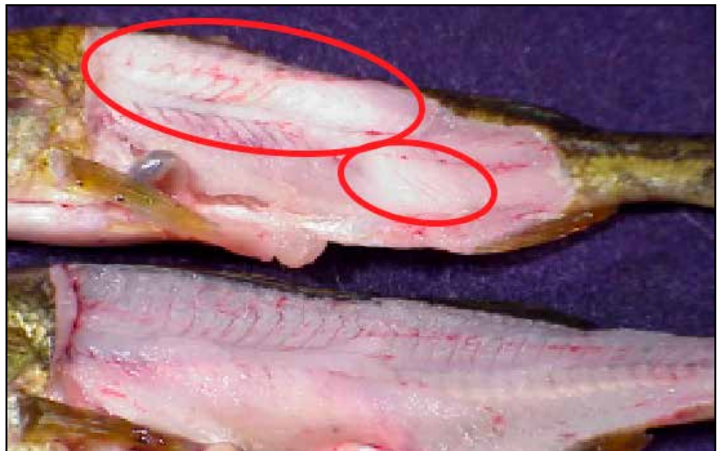
Yellow Perch – top fish with infected muscle tissue, bottom fish with normal muscle tissue.