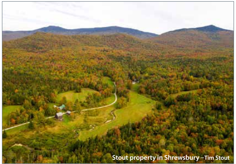
Stout property in Shrewsbury –Tim Stout

VFWD completed a variety of projects with conservation partners to improve streambank and shrubland habitat on 70 acres in the towns of Charlotte and Hinesburg. With an eye on golden-winged warbler, American woodcock, deer, and other species that depend on streambank parcels and shrublands, these projects removed invasive plants and planted native shrubs that provide food and cover for birds and other wildlife.