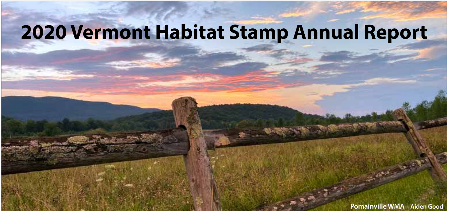
Pomainville WMA – Aiden Good

Last year marked a significant milestone for fish and wildlife conservation in Vermont, and for the Vermont Fish and Wildlife Department (VFWD), as we celebrated 100 years of Wildlife Management Area (WMA) conservation. The special edition 2020 Vermont Habitat Stamp colorfully commemorates the formation of the Sandbar Waterfowl Refuge in 1920, the state's first WMA. Thanks to the generous donations from Habitat Stamp supporters — the highest number of donors and donations since the program began in 2015 — VFWD received $241,968 and the bulk of these donations leveraged $490,803 in federal funds. We put your donations to work in habitat improvement, streambank restoration, private landowner assistance, and land acquisition, including the new Town Farm WMA in Shrewsbury that was dedicated as Vermont's 100th WMA. The VFWD thanks everyone who contributed through the purchase of a Habitat Stamp to manage, enhance and expand these 100 special places.