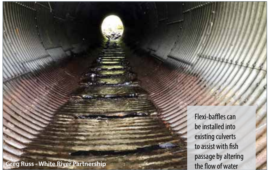
Greg Russ - White River Partnership

VFWD continued floodplain restoration on a 35-acre department-owned streambank parcel along the White River in Bethel, including removing portions of a man-made berm and filling a drainage ditch to restore the site to its natural hydrologic conditions and to allow for floodwaters to enter the floodplain once again. Flood waters carry nutrients and seed propagules that help replenish the regenerating floodplain forest. Additional tree planting and invasive species removal were also completed at the site in 2020.