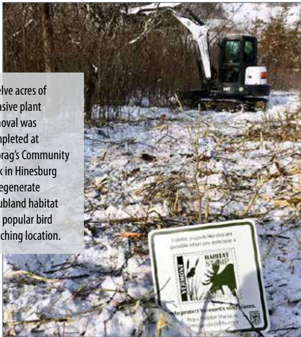
Twelve acres of invasive plant removal was completed at Geprag's Community Park in Hinesburg to regenerate shrubland habitat at a popular bird watching location.

"I've maintained my land for 40 years, but I wanted to explore other ways to manage the forests and streams for wildlife, so I contacted Andrea Shortsleeve with the Vermont Fish & Wildlife Department to come take a look. My primary land management objectives are to control invasive species, sequester carbon, and provide diverse and resilient forest habitat for wildlife. I am looking forward to working with Fish & Wildlife to improve these 400 acres into the future."